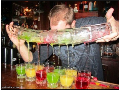
Stoplight Shots being poured.

It's not in the celery fields . . . and it's no MLO party . . . but this event will surely kick you into gear! Put your vacation days in now at work, cause your gonna' need 'em! Join your classmates at our Thursday Night Pub Crawl. What happens at the Pub Crawl, stays at the Pub Crawl! Seriously though, we will fly pictures of the event Saturday night! So get a little crazy for us! 6pm. Details to follow.